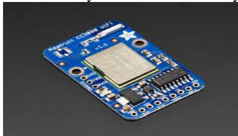
Fig 3: Adafruit CC3000 Wi-Fi Board

For Wi-Fi module we are using TI designed CC3000. The Texas Instrument module is a self-sustained wireless network processor that simplifies the application of internet connectivity. The key benefit of using this module is it minimizes the software requirement of the host micro-controller. It is a low cost low power solution. It comes integrated with a 802.11b/g radio, modem, MAC supporting WLAN correspondence as a BSS station with CCK and OFDM rates from 1 to 54 Mbps in the 2.4-GHz ISM band. It supports all Wi-Fi security modes for individual systems: WEP, WPA, and WPA2. Smart Config™ WLAN provisioning tools permit clients to connect a headless gadget to a WLAN system utilizing a cell, tablet, or PC. Integrated IPv4 TCP/IP stack with BSD attachment APIs enables straightforward web integration with any microcontroller, microchip, or ASIC. Simple APIs enable easy integration with any single-threaded or multi-threaded application. It can work on single pre regulated power supply or can be directly connected to a battery.