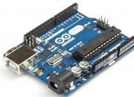
Fig 2: Arduino Uno Board

We will be using Arduino uno board which is a microcontroller board based on atmega328p. It has 14 digital input/output pins (of which 6 can be used as PWM outputs), 6 analog inputs, a 16 MHz crystal oscillator, a USB connection, a power jack, an ICSP header, and a reset button. It contains everything needed to support the microcontroller; simply connect it to a computer with a USB cable or power it with an AC-to-DC adapter or battery to get started. The board operates on 5v power. The board provides effortless interfacing of I/O pins to a variety of other circuits. Arduino platform provides an integrated development environment (IDE) based on the Processing project, which includes support for C and C++ programming languages.